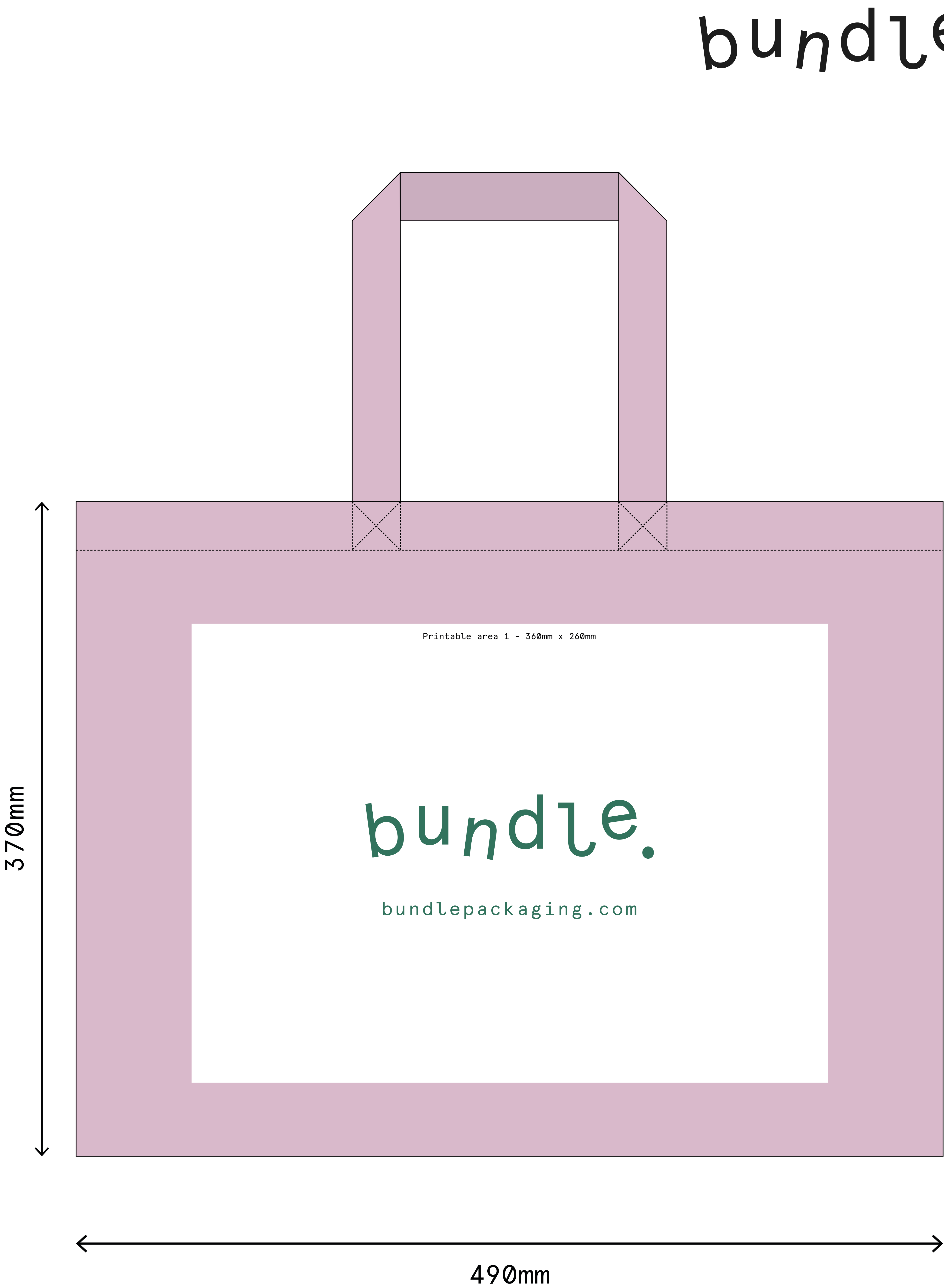
REVERSE Print Area 2: 360mm x 260mm